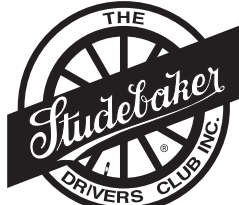
Black & White (Background is white)