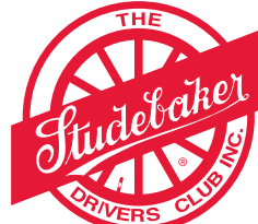
SDC Red & White (Background is white)